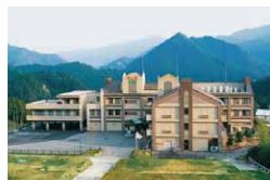
■Peter Rabbit (SENH) Kamikatsu-cho, Katsuura-gun ■Kensyokai DayServiceCenter Kamikatsu ■Kensyokai intro-center Katsuura ■Kensyokai home-care support center Kamikatsu