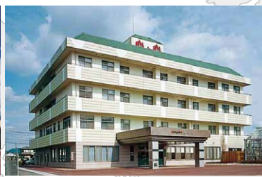
■Kensyoen (NCHFC) Ojin-cho, Tokushima City ■Kintaro Ojin-cho, Tokushima City