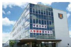
■Tokushima Kensyokai College Kokufu-cho, Tokushima city