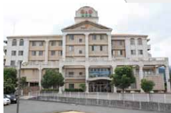
■Kensyokai Provence (CH) Kamojima-cho, Yoshinogawa city ■DC Arles ■Rei ari Yu ari (GH) Kamojima-cho, Yoshinogawa city ■Kensyokai home-care support center Kamojima