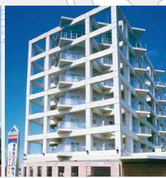
■Kensyokai Liberty (CH) Ojin cho, Tokushima City