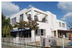
■Ikuei Nursery School Nakashowa-cho, Tokushima city