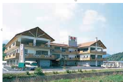
■Kensyokai Heidi (SENH) Sanagochi-son, Myodo-gun ■DC William Tell ■Kensyokai intro-center Heidi ■Sanagochi in-home care management office