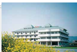
■Kensyokai Heart (GHCF) Kamiita-cho, Itano-gun ■Zou House (DayCare) ■Kensyokai intro-center Itano