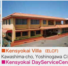
■Kensyokai Villa (ELCF) Kawashima-cho, Yoshinogawa City ■Kensyokai DayServiceCenter