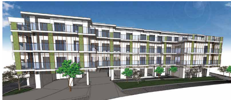
■Elisabeth (SENH) Setagaya Tokyo