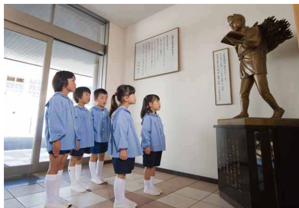
Kinjiro Ninomiya is assumed to be an example, "The mind of study, the diligence, and the filial heart to parents" is learnt, and "Propriety" and "Gratitude" are built.

Komatsushima Kensyokai Nursery School, Tokushima Kensyokai Nursery School, Ikuei Nursery School, Seiran Nursery School