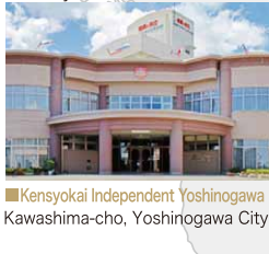
■Kensyokai Independent Yoshinogawa Kawashima-cho, Yoshinogawa City