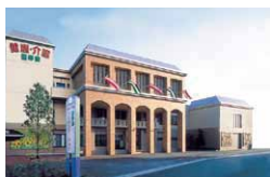
■Kensyokai Presentation Tokushima Kokufu-cho, Tokushima city ■Kensyokai intro-center East