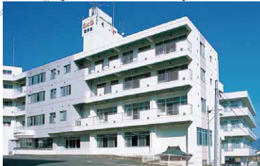
■Kensyokai well (GHCF) Kawashima-cho, Yoshinogawa City ■Tiger House (DayCare)