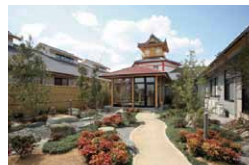
■Nohime (GH) Ishii-cho, Myozai-gun ■DC Kazusanosuke