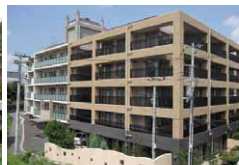
■Ryokufukai Isabel (SENH) Suita city, Osaka ■DC Colombo