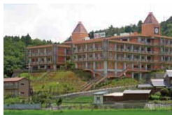
■Kashida no Sato (SENH) Takatsuki city, Osaka ■DC Tongari Boushi ■Ryokufukai intro-center Takatsuki