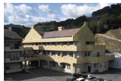
■Kensyokai Edinburgh (ENH) Kamikatsu-cho, Katsuura-gun