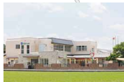
■Seiran Nersery School Kitatamiya, Tokushima city