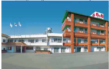
■Suimeiso (SENH) Kawashima-cho, Yoshinogawa City ■Suimeiso DayServiceCenter ■Kensyokai intro-center Central ■Kensyokai home-care support center Kawashima