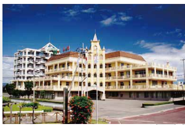
■Kensyokai Moldau (SENH) Ojin-cho, Tokushima City ■DC Zátópek ■Kensyokai intro-center Ojin